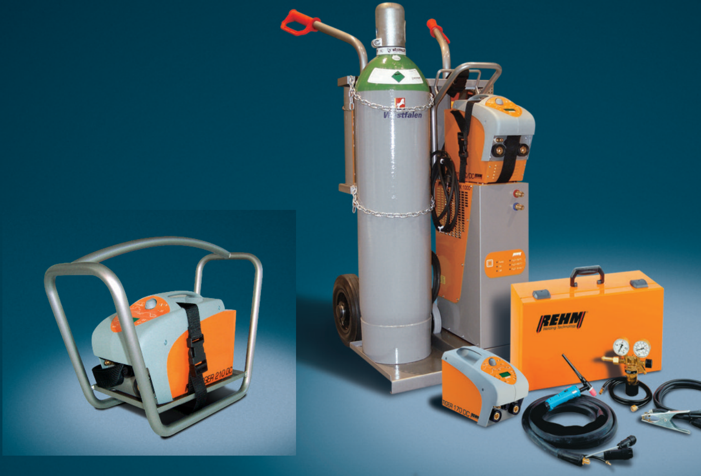
The TIGER accessories: RAMBO.KIT, TIGER SET complete in case, TIGER CART trolley for easy movement of the unit, gas cylinder and water cooler RWK 1000.